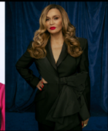
Tina Knowles Entrepreneur, Philanthropist, Designer, & New York Times #1 Best Selling Author Cécred & Perkwood Entertainment