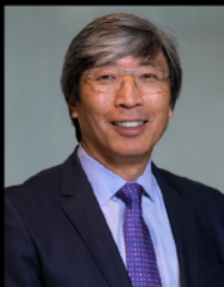
Dr. Patrick Soon-Shiong Founder, Executive Chairman ImmunityBio