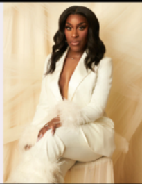
Jackie Aina CEO & Co-Founder FORVR MOOD