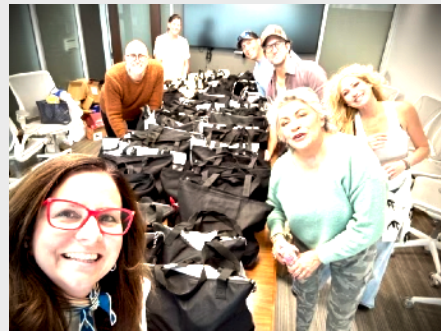
FEI Elves from 2024's event

This annual tradition embodies the spirit of giving—bringing together members, sponsors, and friends to share time, resources, and compassion with families navigating difficult moments. Your participation—whether through volunteering or contributing funds—will help brighten their holidays and remind these families they're not alone.